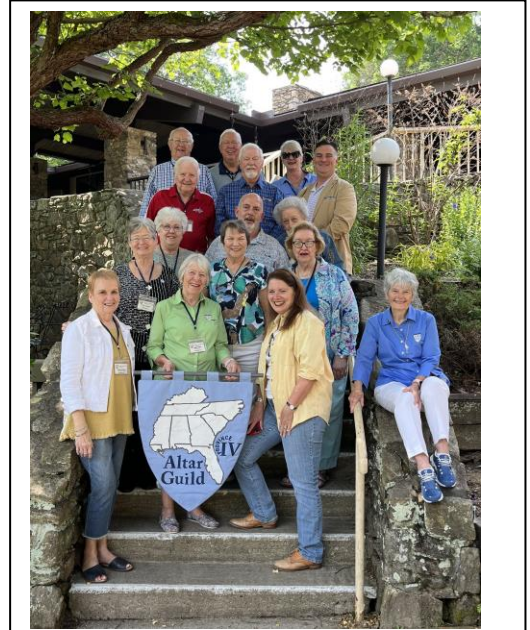
*See list of attendees, below