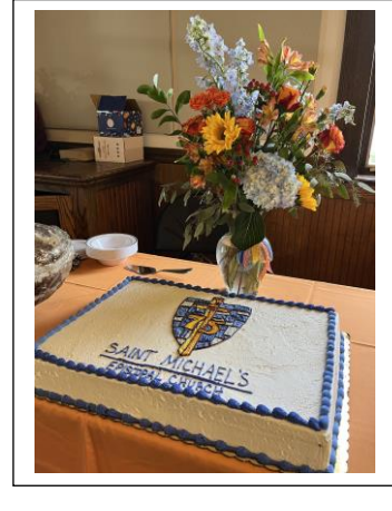
Boy Scout Troop 200