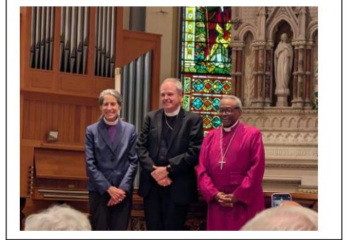
The Right Reverend Katharine Jefferts Schori (Presiding Bishop from 2006 to 2015), Sean W. Lowe (Presiding Bishop Elect), and Michael Bruce Curry (Presiding Bishop from 2015 to 2024)

As a member of the National Altar Guild Association (NAGA) Board, as well as a member of the Central Florida Diocese Altar Guild (DAG), I attended the 81 st General Episcopal Convention and NAGA Triennial meeting in Louisville, Kentucky, in June. I can't tell you what a blessing it was to be able to participate in this meeting, especially since this was a year when a new Presiding Bishop was selected; this occurs every nine years. This was my third General Convention; my first Convention was in 2015 in Salt Lake City, Utah, when Bishop Curry was selected as Presiding Bishop. NAGA typically meets every three years, in conjunction with the General Convention, but attendance at the 2021 Convention was very limited because of COVID, and the NAGA meeting in 2021 was held only by Zoom.