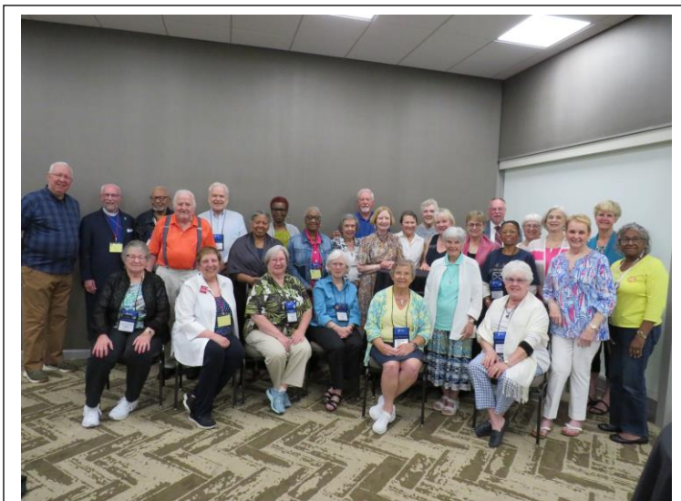
Social Gathering attendees